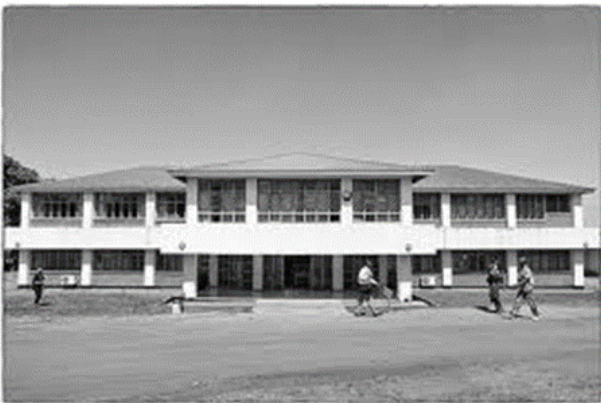
Zomba Mental Hospital

They should ensure that each person is attending for treatment and make contact with them if they default treatment. They should seek advice from the specialist hospital and alert the police if needed.